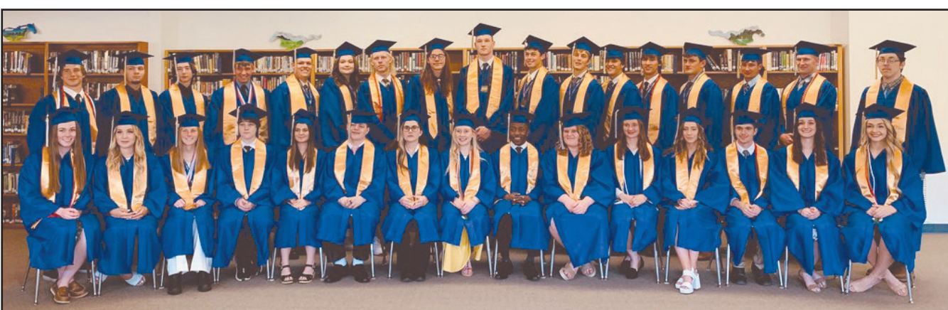
The 2022 Heppner High School senior class graduated on June 4.