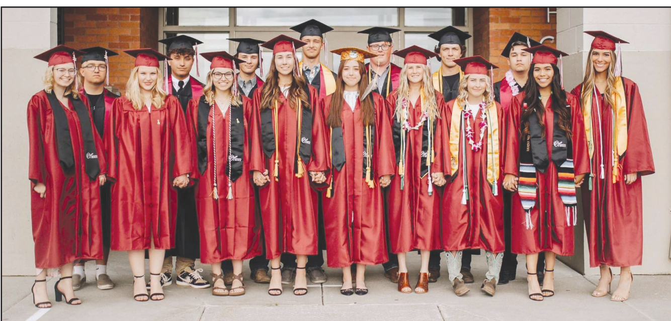
The 2022 Ione High School senior class graduated on June 3.