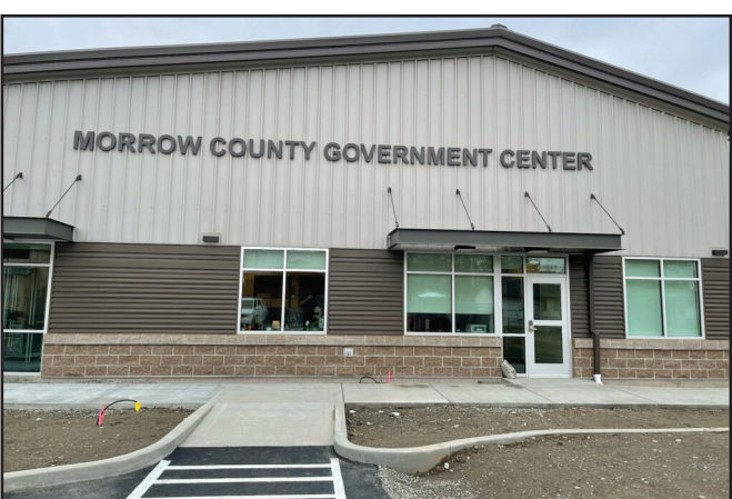
The new Morrow County Government Center in Irrigon is now open.

The new Morrow County Government Center in Irrigon has been recently completed and will hold a ribbon cutting ceremony Thursday, May 26 from 4 to 5 p.m. The building is located at 215 NE Main Avenue.