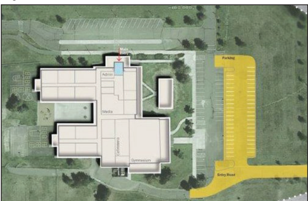
Artist rendering of IES floorplan.