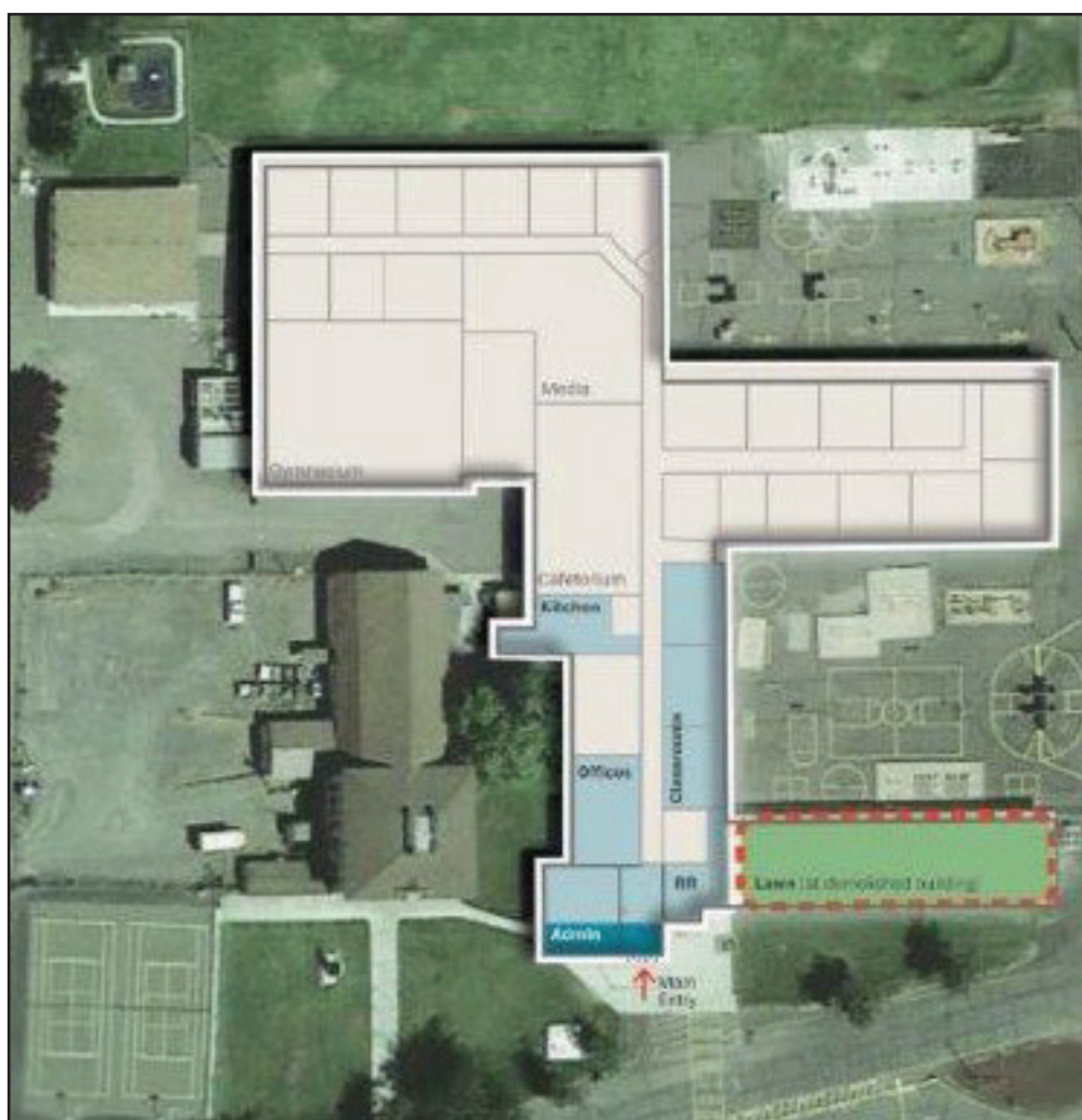
Artist rendering of ACH floorplan.

If passed, the proposed bond measure would raise $138 million, and MCSD would be awarded a matching grant from the Oregon School Capital Improvement Matching (OSCIM) Program of $4 million. A total of $142 million would be available for proposed projects. "Having the OSCIM