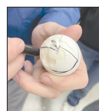
Students analyzed a container that failed the drop, where the design failed and how to improve their containers