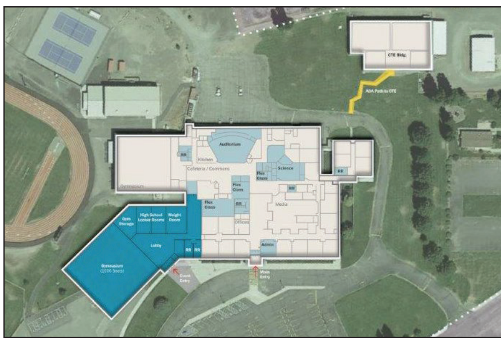
Artist rendering of RHS floorplan.

If passed, the proposed bond measure would raise $138 million, and MCSD would be awarded a matching grant from the Oregon School Capital Improvement Matching (OSCIM) Program of $4 million. A