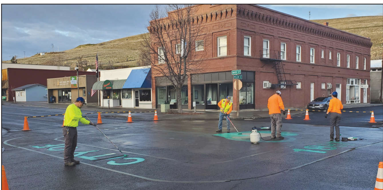
Heppner maintenance workers repaint the shamrock in preparation for the Wee Bit O' Ireland St. Patrick's Day celebration to take place March 11-13 and 18-19. The event will provide fun for the whole family, including a parade, games, food, entertainers, beer and wine and bull-riding.