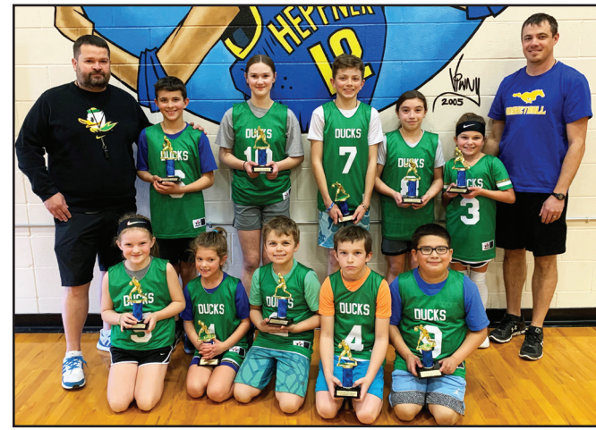
Colt basketball Champions, the Ducks

Colt basketball is back. This year over 50 second through sixth graders from Heppner Elementary participated in Colt Basketball.