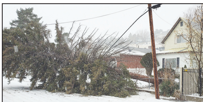
A tree fell across the street in Heppner after high winds early Sunday morning.