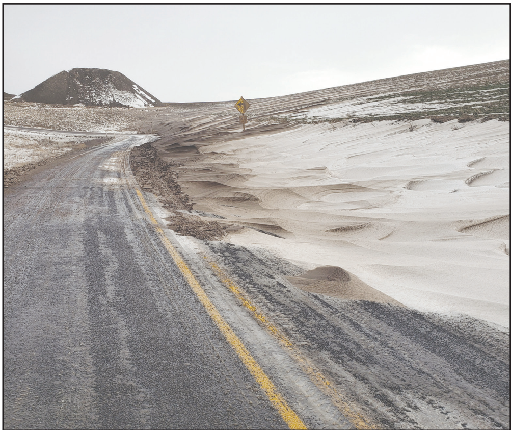
Deep snow drifts were reported on Sand Hollow Rd (left and above) by the Morrow County Road Department. The main arterial roads are cleared first, then the crews begin working on the secondary roads. According to Public Works, the crew is smaller than previous years and some of the equipment is down waiting for parts. Travelers are reminded to stay safe, check conditions prior to traveling and allow extra time.