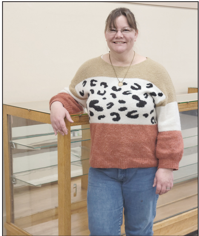
Contact the Chamber at chamber@gmail.com for 541-676-5536 or heppner- additional details.