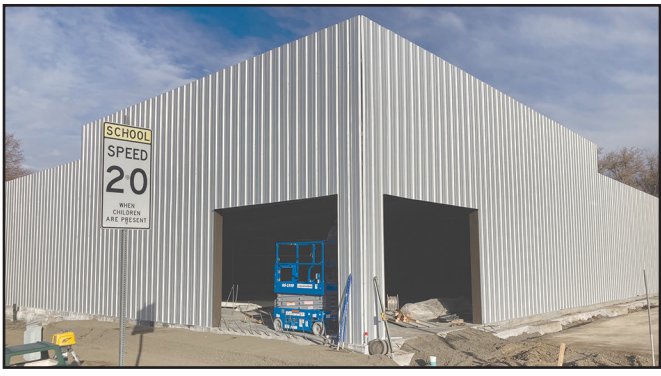
Construction on the new Dollar General on Main Street continues to progress. Company officials have said that the construction is scheduled to be finished at the beginning of the year. So far, the concrete floor has been poured, and the roof and walls have been put up.