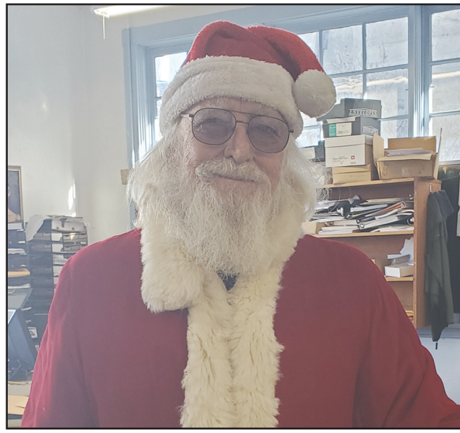
Santa stopped by the Heppner Gazette-Times on Tuesday to find out who had been naughty or nice.