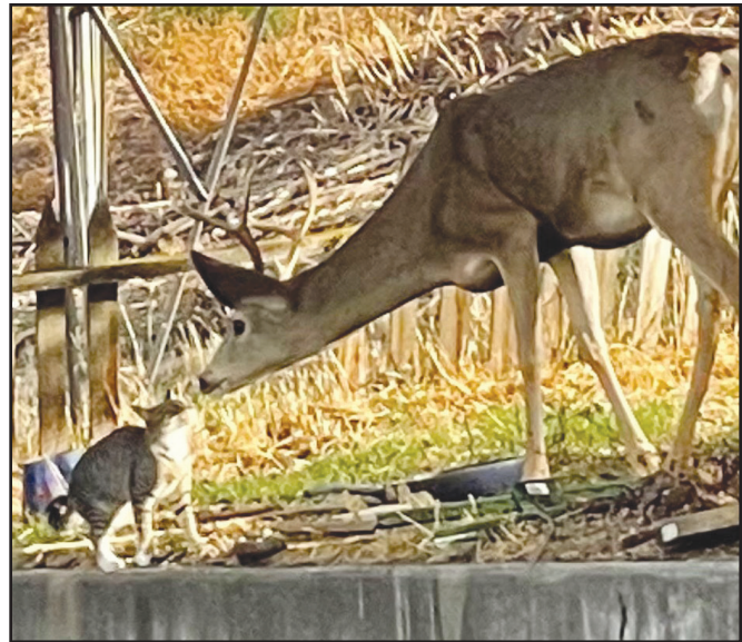
This photo of a deer and cat visiting each other was submitted by one of our readers. Photos may be submitted to the Gazette by emailing to editor@rapidsolve.net or uploading to the website Heppner.net.