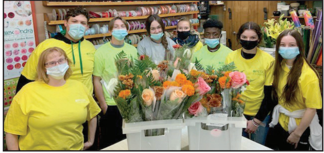
Country Rose and volunteers participated in the Petal it Forward event last week.