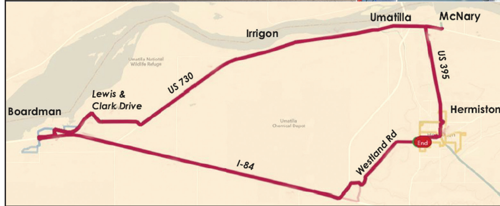
A new plan offering bus service from Hermiston to Boardman has been approved by county commissioners. The system would be operated by the existing Umatilla Indian Reservation transportation system. Pictured above is a bus and the proposed route.