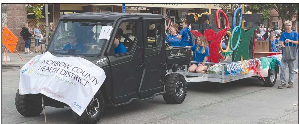
Morrow County Health District was the second-place winner in the commercial float category.