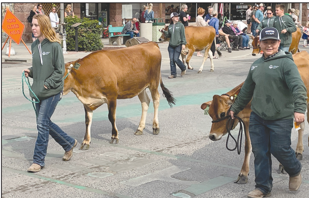
Members of the Threemile Canyon Farms Dairy Heifer Project were the first-place winners in the commercial float category.

The winners of the parade categories have been announced by the Heppner Chamber of Commerce. The parade was held Saturday, August 21 in down-