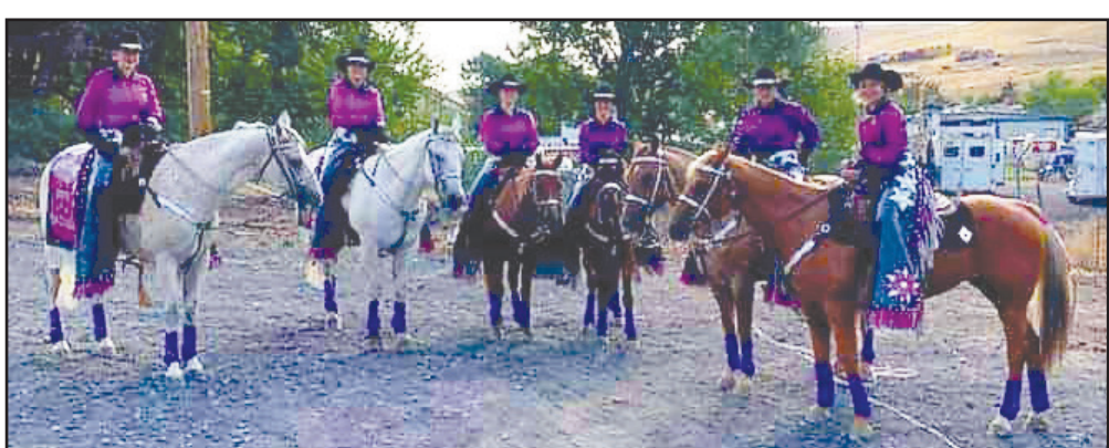
The Owyhee Nite Dazzlers took second-place in the rider's category for the parade.