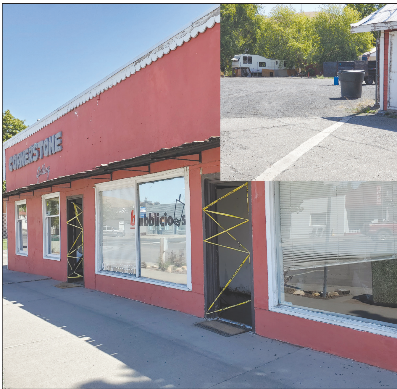
Sale of this Main Street property has been completed and construction of a new Dollar General store will now begin in Heppner. Monday workman were already inside the former Cornerstone Gallery building, and the former RV park now sits empty of trailers (inset).

According to Dollar General, the store will sell "quality, name-brand and private brand merchandise such as foods, health and beauty products, home cleaning supplies, housewares, stationery, seasonal items and basic clothing." In its statement to the Gazette-Times, Dollar General emphasized the company is "deeply involved in the communities it serves and is an ardent supporter of literacy and education through the Dollar General Literacy Foundation, which awards grants each year to nonprofit organizations, schools and libraries within a 15-mile radius of a Dollar General store or distribution center to support adult,