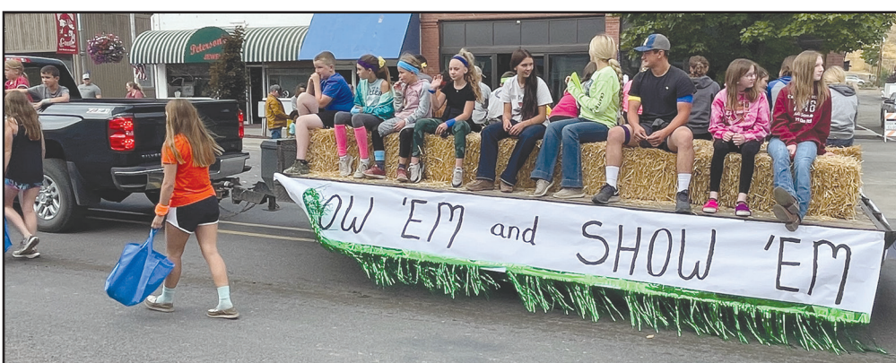
The Grow 'Em and Show 'Em 4-H Club float took second in community floats.