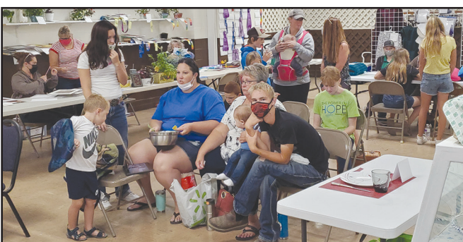
Contestants wait for their turn during live judging in the 4-H Annex.