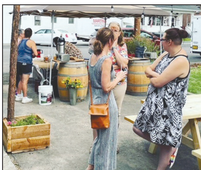
Left and above: Guests mingled, socialized and checked out the new bookstore that has opened in Heppner.

Flood Town Books recently opened at 413 N. Main Street in Heppner, celebrating with a grand opening on July 31. At the grand opening guests enjoyed snacks, drinks, prizes