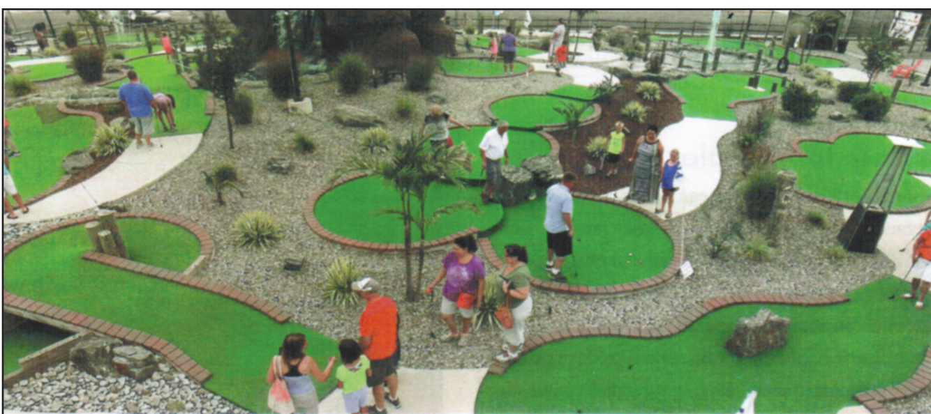
A professional miniature golf course company from New Jersey would design the course.