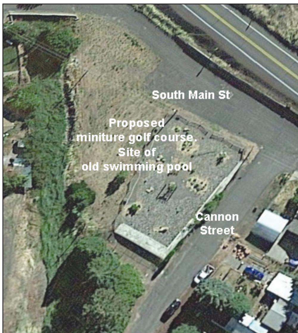
The proposed course in Heppner would be on one half acre at the old swimming pool site.