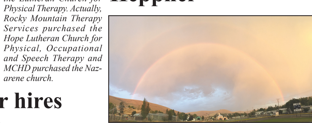
Petra Payne took this photo of a double rainbow over Heppner on June 30.