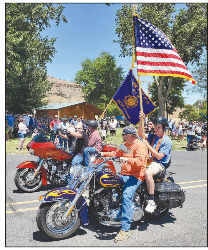
People celebrating the 4th of July stand for the singing of the National Anthem and display of the flag by these Harley Davidson flag bearers before start of the parade Sunday in Ione. More Ione 4th of July photos on page 8.