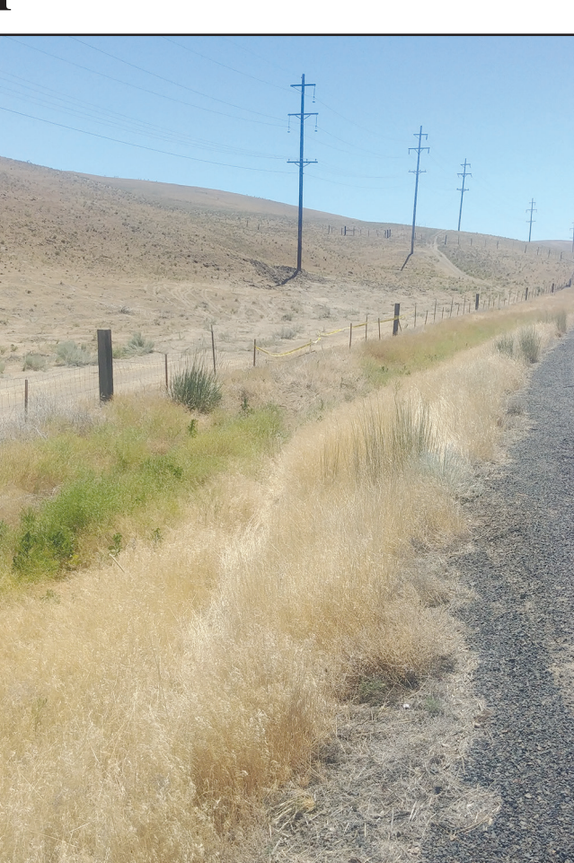
A power outage that began around 2 a.m. on July 5 and lasted until approximately 10 a.m. was reportedly caused when a white Ford pickup ran off the road, through a fence and took down a power pole on Hwy 74 near MP 40. Tracks in the grass show the route the pickup took from the road to the pole, which has now been replaced. Power was interrupted in Lexington and Heppner.