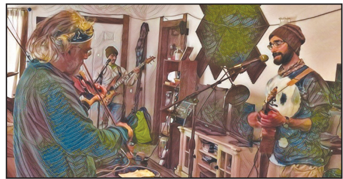
Neymark and Sons will perform Sunday, July 11 for Heppner's Music in the Park.