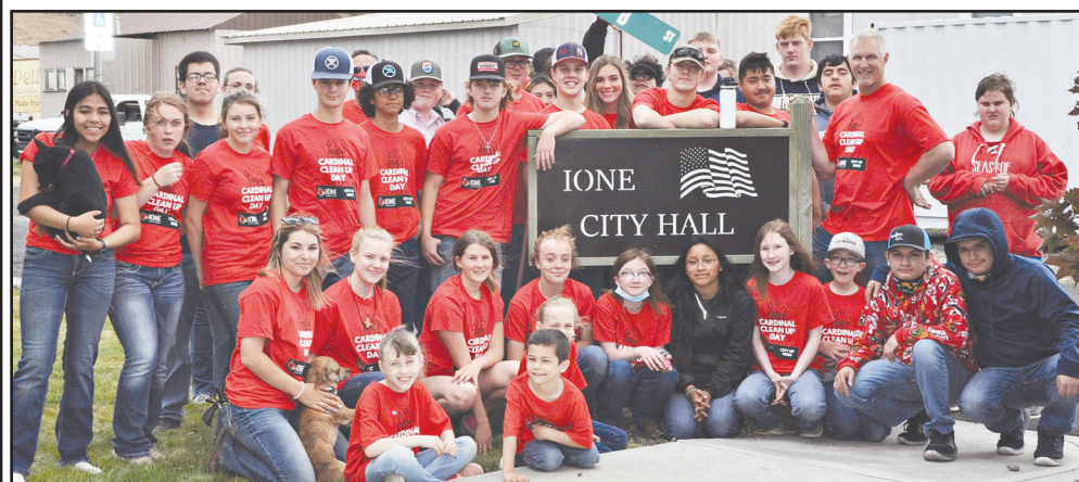
Many volunteers came out to help with the Cardinal cleanup day in Ione May 27.

On May 27, 2021, the City of Ione and the Ione Community Charter School joined forces to hold their first joint Cardinal Clean-up Day. The city partnered with the school to tackle the cleanup of the school's grounds and common areas of Ione in time for summer activities.