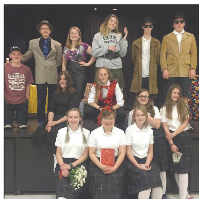
The cast of Matilda.

The Heppner High School drama club will present Matilda on May 19 and 20 at 7 p.m. in the high school cafetorium. Admission will be $3 per person and masks are required. Seating is limited so those interested in attending should call or text 541-701-7400 to reserve a seat. Students participating in the production are