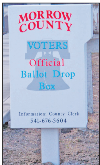
Official drop boxes are located throughout the county.

Heppner: Behind the Bartholomew Building, in the parking lot. Open 24