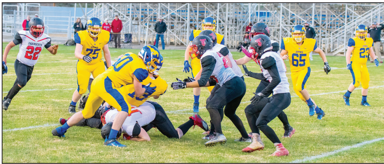
The Heppner Mustangs defeated the Weston-McEwen Tigerscots 41 to 0 at home last week.

The Heppner Mustang football team won another game in dominating fashion by defeating the Weston-McEwen Tigerscots with a score of 41-0. The Mustangs, who are 4-0 on the season, racked up a total of 449 yards of total offense and had 17 first downs in the game. The powerful Heppner defense held the Tigerscots to -25 total yards in the game and didn't allow a first down to Weston-McEwen (W-M) for the entire game.