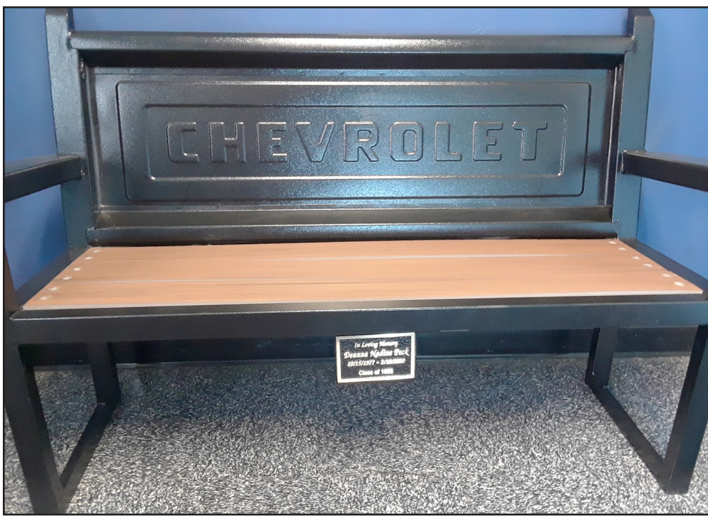
Above: Completed bench resides at Heppner High School. Below: Work in progress as the bench was being built.