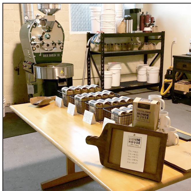
Browne House Coffee's roasting room is open on Wednesdays for samples.