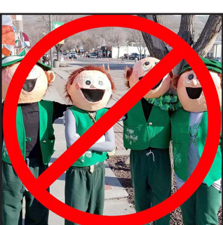
Because of COVID there won't be any leprechauns roaming the streets of Heppner this March.

'We don't want it becoming a super spreader'