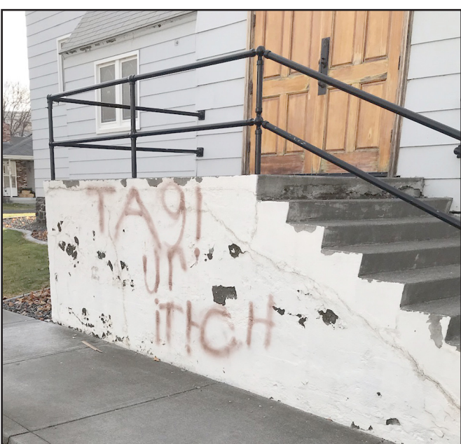
Graffiti at the Episcopal Church.