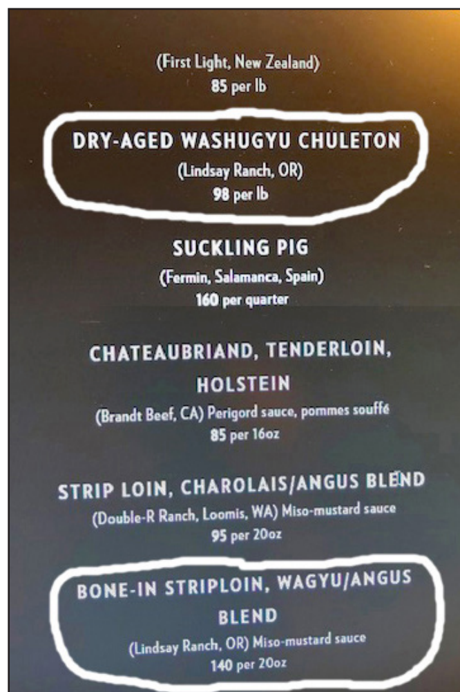
Two Lindsay Ranch dishes are featured on the menu at the Bazaar Meat Restaurant in Las Vegas.

About raising the beef, the company says Washugyu has a harvest period of approximately 27 to 35 months. "The Washugyu cattle are on this feeding program for about 30 months; far longer than most domestic cattle in the