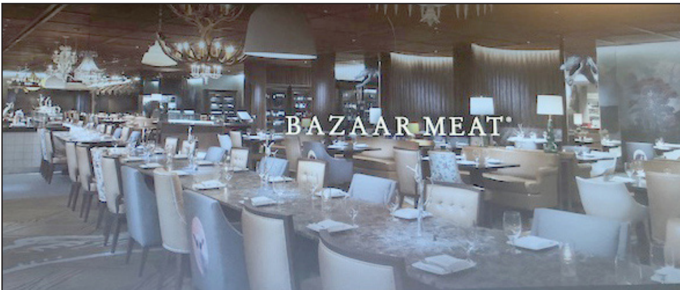
'Bazaar Meat by José Andrés is a wild and wonderful celebration of the carnivorous, in all its forms,' says the Las Vegas restaurant web site.

Lindsay Washugyu beef is on the menu at upscale Bazaar Meat