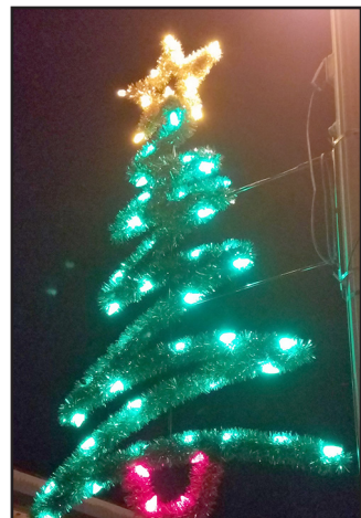
Heppner city crew has lit up the town.