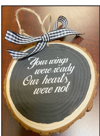
Personalize an ornament with your loved one's name.

This past year fundraising dollars have been used for massages to ease pain, Halloween costumes for children coping with the loss of their father, technology to record voice histories, equipment to transfer hospice clients from wheelchair to vehicle seats and for reaching out to isolated clients to provide them with creative and interesting gift bags. "Our