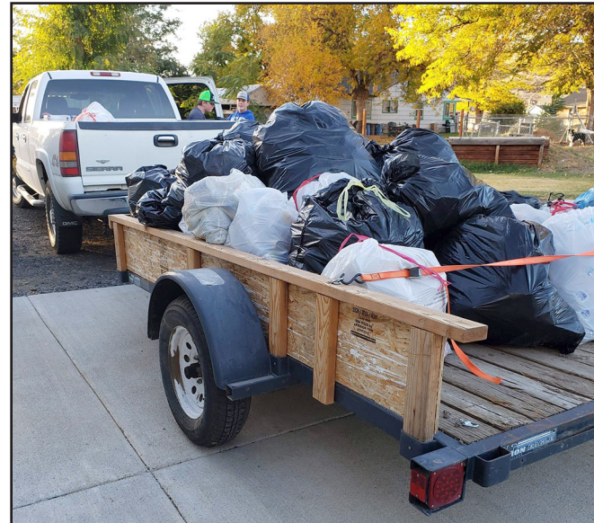
Students gather a trailer full of cans in support of booster club activities.

The Ione Booster Club is asking all those who want to show their support for students and their school to attend a meeting Wednesday, Nov. 18 at 6 p.m. at the Ione Legion Hall.