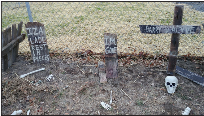
Houses have been decorated all over town in Lexington and Heppner.