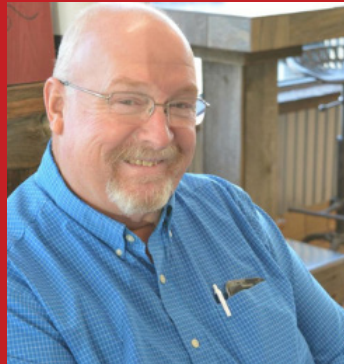
Senator Lynn Findley State Senator - Senate District 30