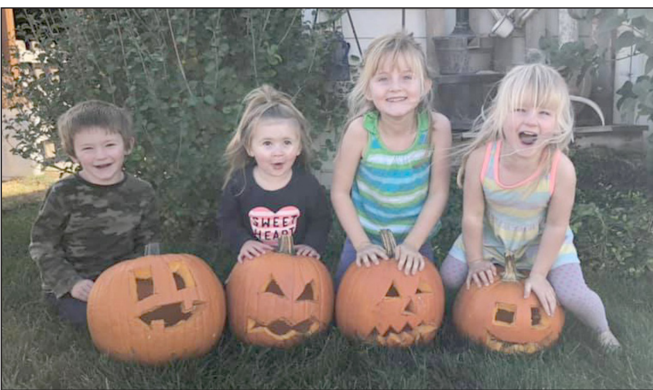
The Miles and Schiller kids show off their pumpkin carving skills.