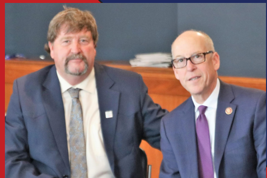
Congressman Greg Walden Oregon Representative - 2nd District