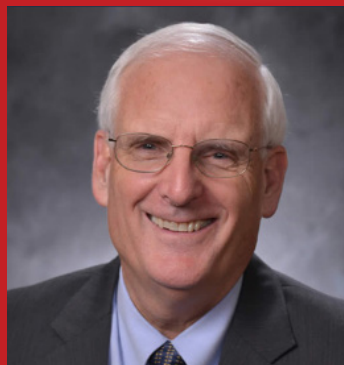
Senator Bill Hansell State Senator - Senate District 29

Trusted Leadership ★ ★ ★ Trusted Endorsements