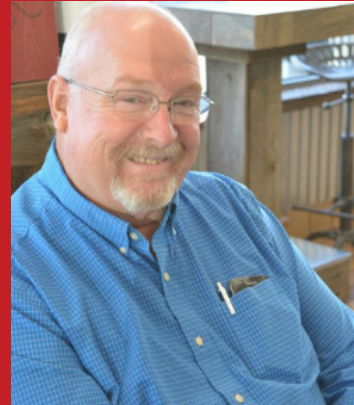
Senator Lynn Findley State Senator - Senate District 30