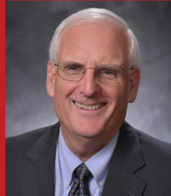
Bill Hansell State Senator - Senate District 29