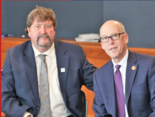
Congressman Greg Walden Oregon Representative - 2nd District