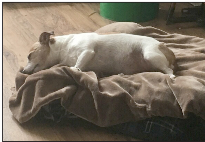
Matt's 'kid' taking quarantine easy