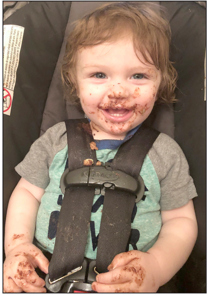
Raze enjoying a snack like many of us during quarantine