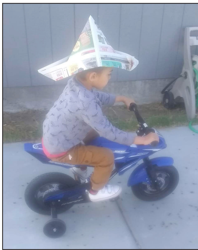
That's quite a hat you have there.