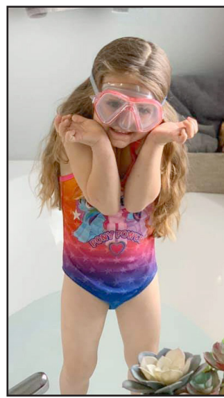
Enjoying her indoor pool