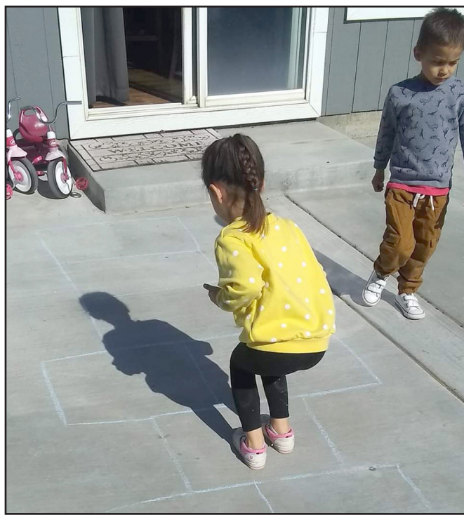
Learning how to play hopscotch.