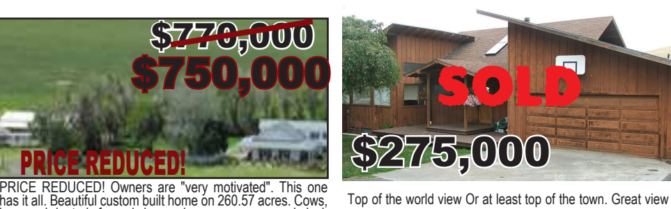
Top of the world view Or at least top of the town. Great view of Heppner from the exciting 4 bedroom 2.1 bath home on the hill overlooking the fairgrounds. Visit with friends and family while preparing meals in your beautiful open kitchen. Enjoy the expansive carpeted living room in this one of a kind home. Must see to fully appreciate, call for an appointment today.

Seven lots available priced very reasonably from $8,500 and $15,000