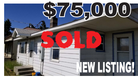
looking Heppner. From the beautiful hardwood floors to the extra downstairs kitchen this home has so much to offer. There is even an attached shop for the handy hobby person in your family. How about barbecuing on the upstairs covered deck with a view of town, or on the downstairs covered patio. Downstairs also has a separate entrance, perfect for quests or the mother in law 345 N Gilmore Heppner

Well kept two bedroom 1 bath home in Heppner. Chain linked fenced yard for kids or pets. Small shop. Clean and ready for you to move into with all the appliances. Stacked Washer and Dryer, Refrigerator, Oven and Dishwasher. New electrical in kitchen, laundry and bath. New plumbing. Remodeled kitchen and bath. Call for an appointment to have a look. 355 Linden Way Heppner