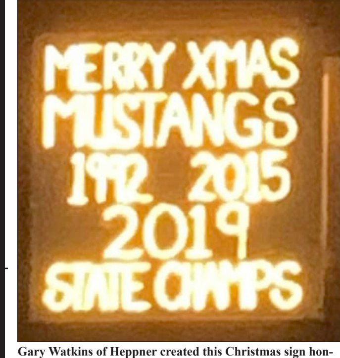
oring the Mustangs for their state championship win.

Online condolences for the family may be left at www.burnsmortuaryhermiston.com.