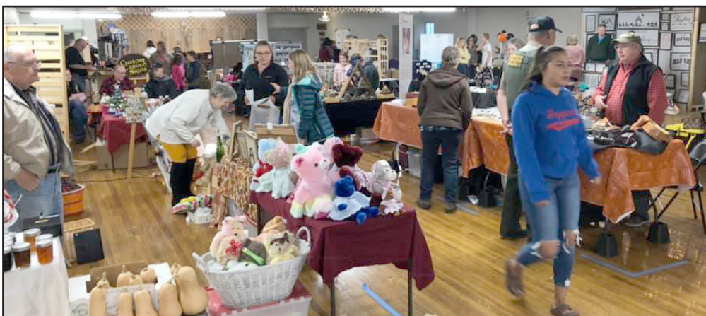
The Heppner Outreach Council Fall Festival included vendor booths and tractor rides as well as many other events and games.