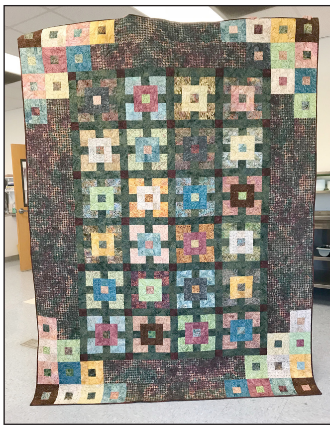
This quilt will be raffled at the quilt show on Oct. 12.