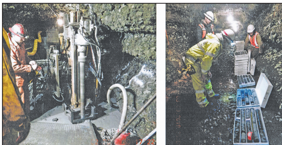
Workers drill into the Willow Creek Dam taking core samples for study. The drilling is part of the periodic inspection of the dam and was done in February and March of this year.

Safety, water quality and stream erosion discussed