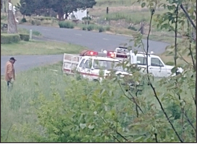
The Lexington Fire Department pulled trees that were washed down during high water from Willow Creek near B Street in Lexington on Monday.