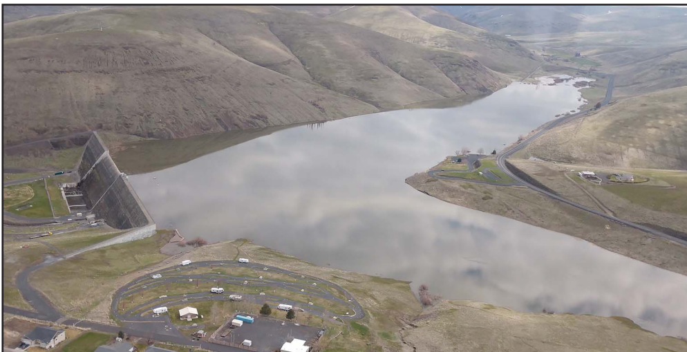
Aerial view of Willow Creek Dam and Reservoir.