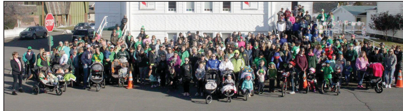
More than 200 people came out to enjoy the sunny day and participate in the 11th annual Remembrance event.

Friends Helping Friends celebrated the 11th annual Remembrance Walk/Run with over 200 walkers and runners participating in the event on March 16. The morning sunshine cooperated to bring out the many men, women and children who supported the event, beginning with the social hour at the Heppner United Methodist Church.