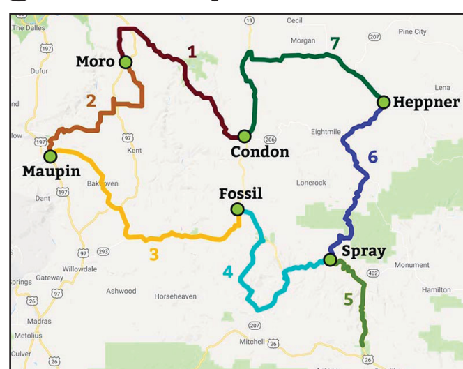
Riders will begin their ride in Condon and travel to Moro, Maupin, Fossil, Spray and Heppner before returning to Condon.

Riders will experience great history, landscape, rushing rivers and canyons as well as visiting a ghost town, seeing a century-old one-room schoolhouse and learning about local history at a world-class museum. And, of course, they will experience the depth of