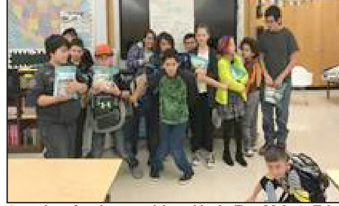
A number of students participated in the Taco Make 'n Take in October.