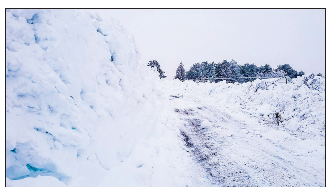
Morrow County Public Works was working hard to keep roads passable after several inches of snow fell Sunday and Monday. Above: Drifts on Carlson Lane. Below: A grader on Liberty School Road breaks through the deep drifts.