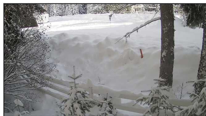
Below: Morrow County's Cutsforth Park was covered with snow.

ALL NEWS AND ADVERTISEMENT DEADLINE: MONDAYS AT 5:00 P.M.