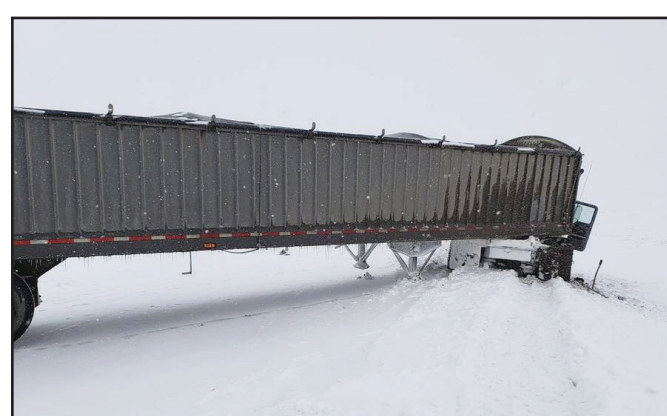
A semi jackknifed and was blocking the highway near Cutsforth Corners on Monday.