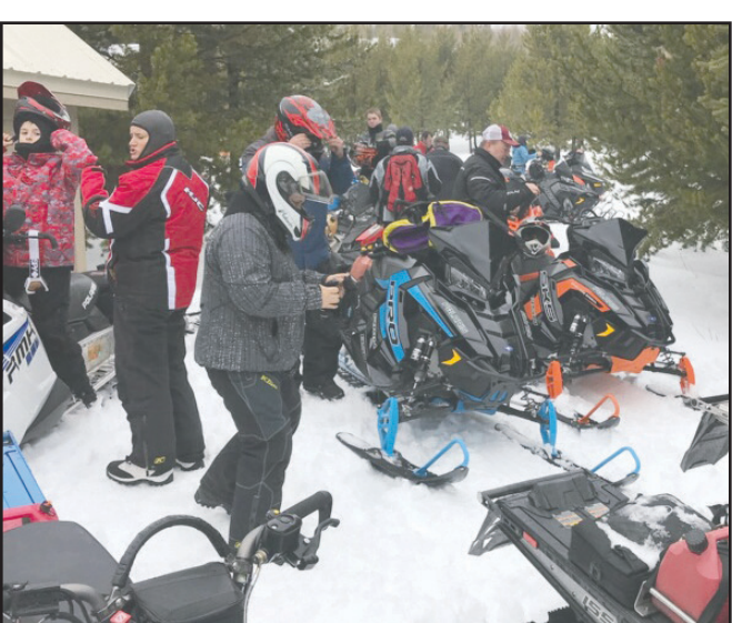
Snowmobile club members enjoy the snow on a recent outing.

The Four Corners Snowmobile club held its annual Holiday playday at Kelly Prairie Sunday, Dec. 29. Over 70 snowmobile enthusiasts and their families were there to enjoy the fresh powder snow on the prairie, the groomed trails and the annual poker run that paid out 100 percent of the entry fees.