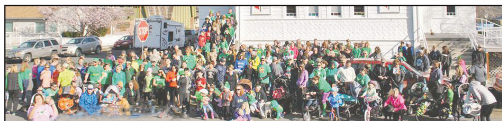
Participants of the 2016 St. Patrick's Day Remembrance Walk gather in front of the Methodist Church.