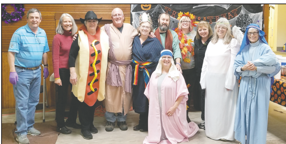
A Community Halloween Party was hosted by the Hopeful Saints Mission Trippers, pictured above.

Bank of Eastern Oregon, Willow Creek Terrace, Heppner City Hall and Hopeful Saints all got into the holiday spirit last Wednesday for Halloween. BEO employees dressed as their favorite rock stars while the city hall theme was nursery rhymes. The Hopeful Saints Mission Trippers posed in their costumes as did employees at Willow Creek Terrace.