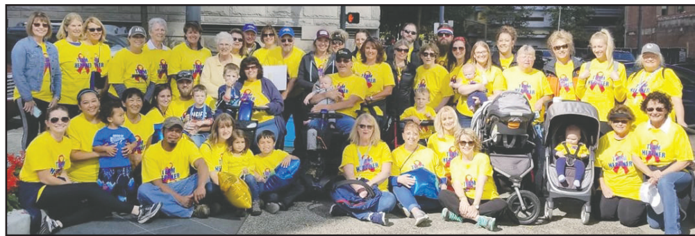
Bucknum's fundraiser will support Team Heppner to Defeat ALS pictured above.

Bucknum's Tavern in Heppner will host a benefit dinner to raise money for the fight against ALS on Wednesday, Oct. 10. Eleven tables will be sold for $100 each that will include a complete dinner for four people, with half of the table fee being donated to Team Heppner Walk to