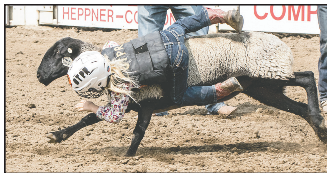
Looks like the mutton is doing the bustin' with this young cowpoke.