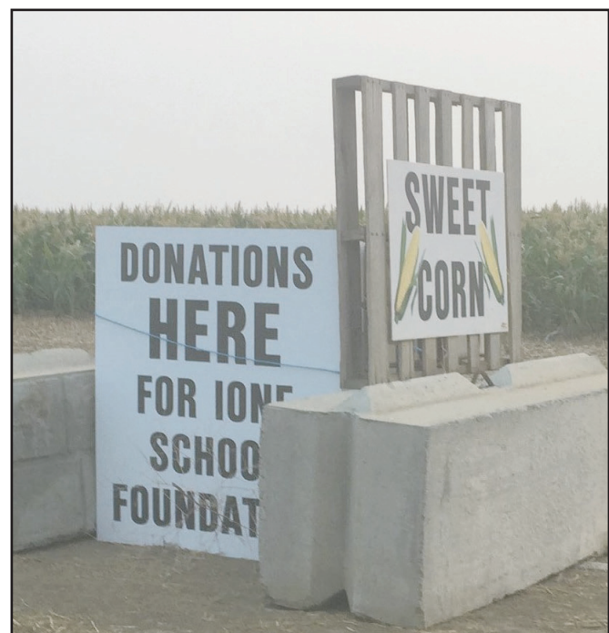
Off Rhea Creek Road near Lone take Morter Lane until you come to the "Drive Slow" sign, from there go 1.5 miles to the field of sweet corn.