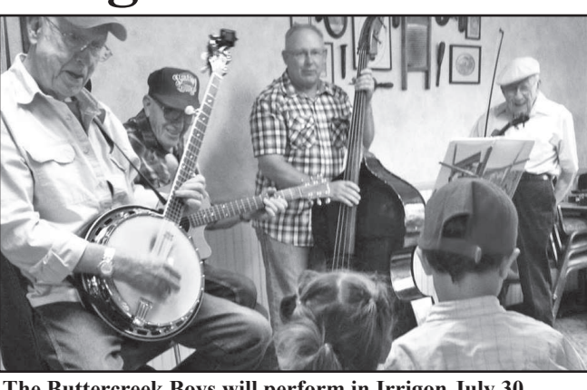
The Buttercreek Boys will perform in Irrigon July 30.

The Buttercreek Boys sing along. will perform July 30 at 7 p.m. at the Irrigon Marina Park for the Music in the Parks outdoor concert se-