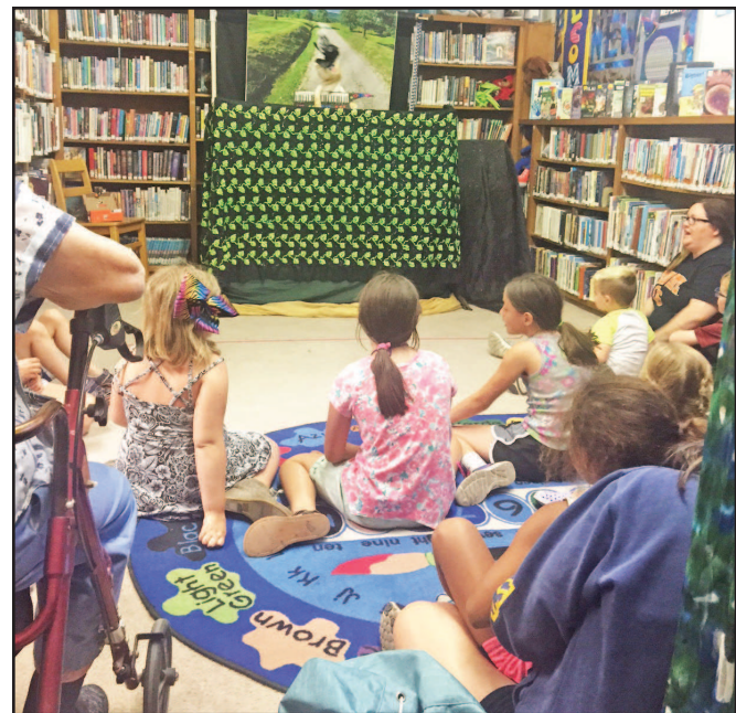
Oregon Trail Library District hosted Penny's puppets as part of the 2018 summer reading program "libraries rock."