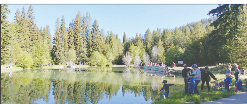
It was a beautiful day at Cutsforth Park for the 13 th annual fishing derby.