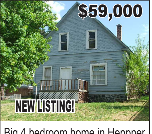
Big 4 bedroom home in Heppner